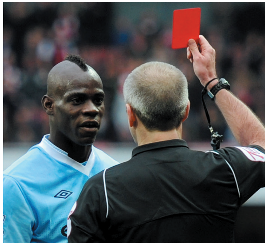
Mario Balotelli, playing for Manchester City, is shown a red card during a match against Arsenal.